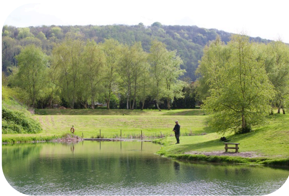
Rose Lake, looking towards the Surrey Hills