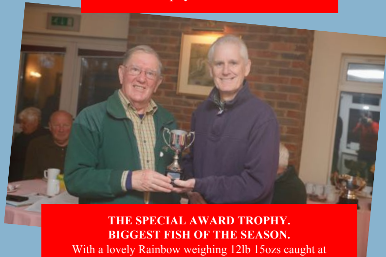
THE SPECIAL AWARD TROPHY. BIGGEST FISH OF THE SEASON. With a lovely Rainbow weighing 12lb 15ozs caught at